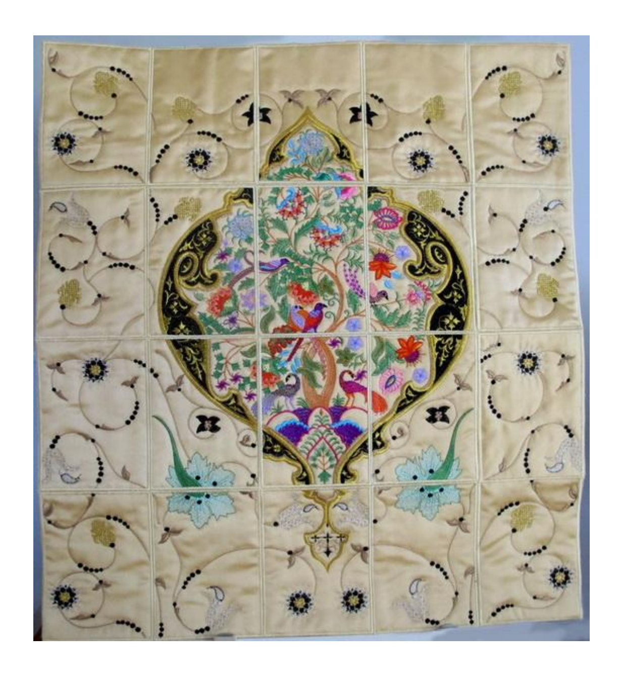
This quilt was stitched on satin silk

Measurements of Vasanta quilt is the following 24.8 wide x 27.6 inches length or 63 wide x 70 cm length