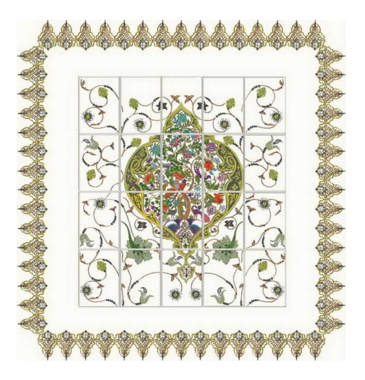
Showing you the layout using the border designs This photo is included in your colour chart