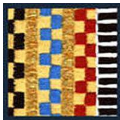
Figure No 1