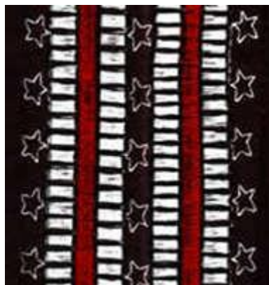
Figure No 4