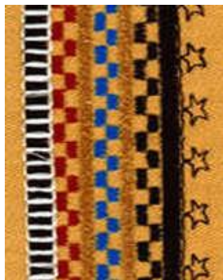
Figure No 3